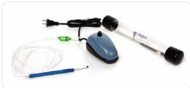
:: O2xyDot Application Kit Part # 300267-502

Dot Glass Substrate: Part # C-601-100 (For liquids and high temperature environments).