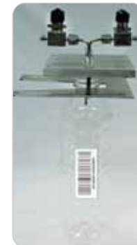
:: BottlePerm Fixture Part # 300450-501