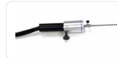
Package of Needles: Part # 300378-501 Invasive Adapter: Part # 300363-501