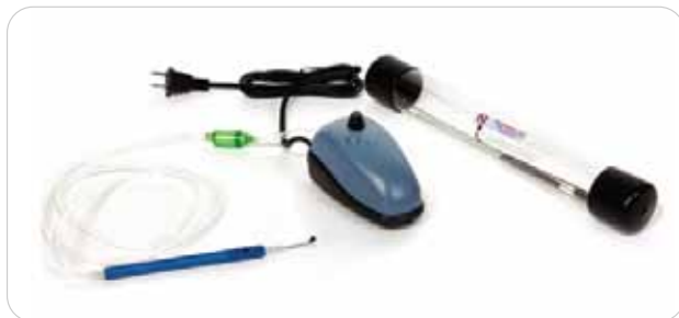
:: O2xyDot Application Kit Part # 300267-502

Dot Glass Substrate: Part # C-601-100 (For liquids and high temperature environments).