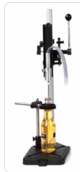
:: Bottle and Can Press - Part # 300270-504