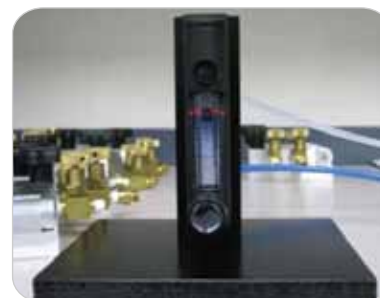
:: Permeation Gas Flow Meter Part # 300446-501