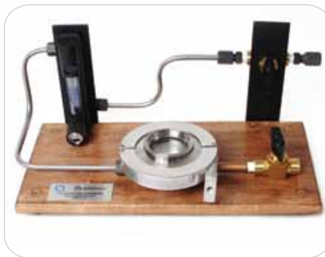
:: Calibration Chamber Part # 300362-501