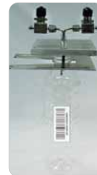
:: BottlePerm Fixture Part # 300450-501