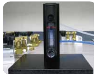
:: Permeation Gas Flow Meter Part # 300446-501