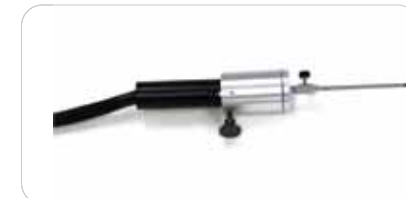
Package of Needles: Part # 300378-501 Invasive Adapter: Part # 300363-501