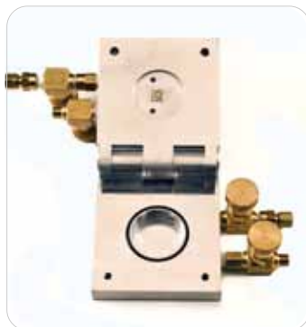
:: Permeation Chamber Part # 300364-501