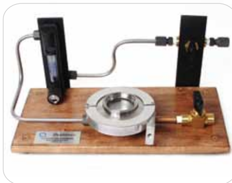
:: Calibration Chamber Part # 300362-501