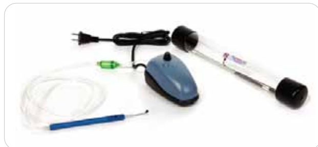
:: O2xyDot Application Kit Part # 300267-502

Dot Glass Substrate: Part # C-601-100 (For liquids and high temperature environments).