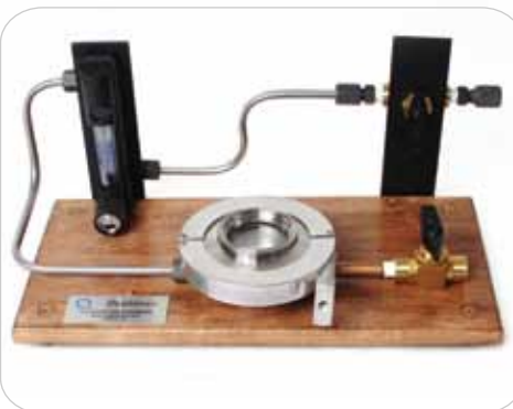
:: Calibration Chamber Part # 300362-501